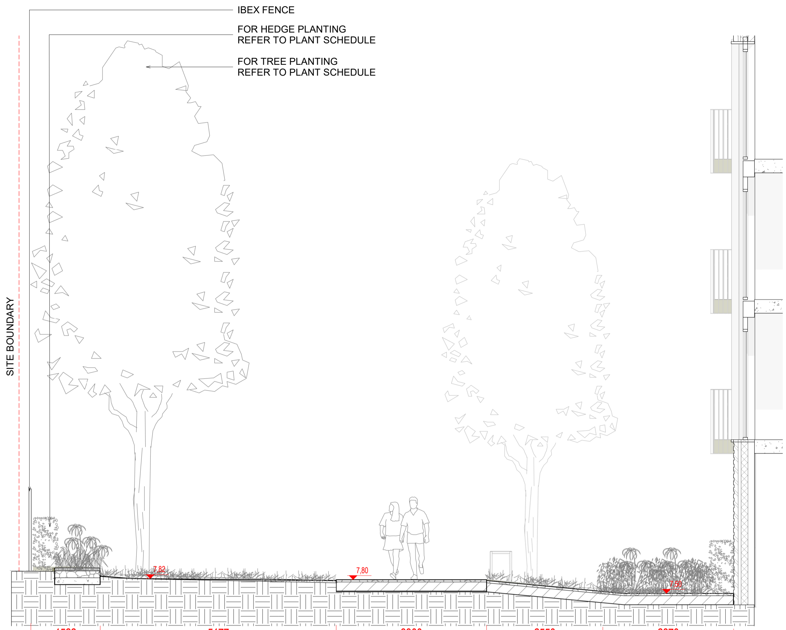
2 SECTION 02 1:50 @A1